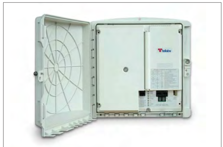
Figure 1. The Tellabs® 1600-612 SFU ONT

The Tellabs 612 ONT provides a 54–870 MHz CATV Amplitude Modulated-Vestigial Side Band (AM-VSB) service over the 1550 nm optical wavelength on the PON in compliance with the G.983.3 standard. The CATV service can handle a variety of digital and analog channels and supports MoCA capability. The ONT functions as an addressable tap on the cable plant and can be enabled or disabled remotely to control CATV theft.