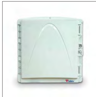
Figure 3. Optional outdoor enclosure