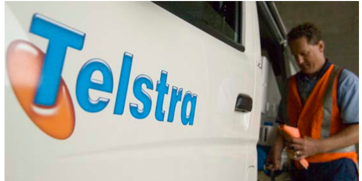
Telstra's vision is to be a fully integrated media communications company and key supplier of content, carriage and distribution throughout Australia.

In April 2007, less than 18 months later, Telstra unveiled the largest fully integrated wireline and wireless national Internet Protocol (IP) network in the world — the Telstra Next IP™ network. Telstra had invested AUD$1.5 billion to establish this network, which serves over 95% of Australian businesses. Combined with Telstra's Next G™ wireless network, the Telstra Next IP network offers a seamless user experience with one-command simplicity.