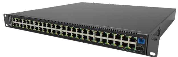
Figure 6: Tellabs FlexSym 248 Optical Network Terminal (ONT248) is currently in controlled Limited Availability release status*

For powered device connectivity using Power over Ethernet (PoE), IEEE 802.3af PoE, PoE+ IEEE 802.3at (Class-4 negotiations) and IEEE 802.3bt (4PPoE) can be selected. The ONT248 can support all 48-ports of 4PPoE supporting 802.3af/at/bt and all 48-ports supplying 60 watts per port, with a total capacity of up to 3,000 watts possible with dual power supplies utilized.