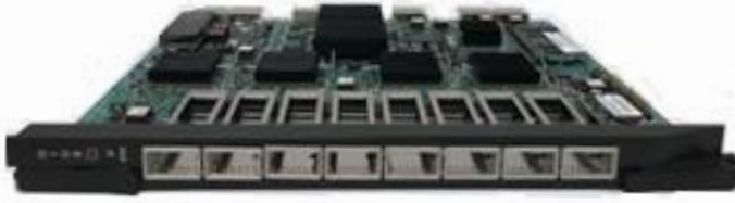
Figure 3: Tellabs FlexSym Optical Interface Unit Eight (OIU8)