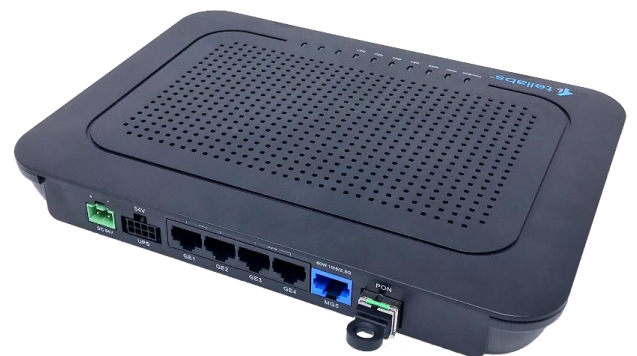
Figure 6: Tellabs FlexSym 205 Optical Network Terminal (ONT205)

For Power over Ethernet (PoE) support, IEEE 802.3af PoE, PoE+ IEEE 802.3at (Class-4 negotiations) and IEEE 802.3bt (4PPOE) can be selected on the ONT205. The ONT205 can support three ports of 4PPoE supporting 802.3af/at/bt. The maximum PoE power when local powered is 140 watts and the maximum PoE power when remote powered is 90 watts.