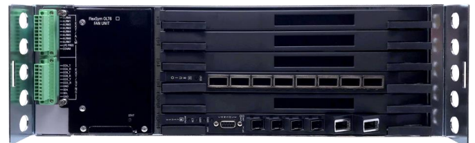
Figure 2: Tellabs FlexSym Optical Line Terminal Six (OLT6)

The Optical Line Terminal (OLT) will likely be located in the main data center. The purpose of an OLT is to act as a distribution and aggregation switch across an enterprise network. An OLT can provide greater connectivity density in a smaller footprint than a traditional network design. Right sizing 10-gigabit connectivity inside buildings, and across a campus, starts at the OLT. For example, from a 5 Rack Units (RU) high Tellabs® FlexSym™ Optical Line Terminal Six (OLT6) you can support up to 32 PON interfaces, up to 2,048 ONTs and up to 8,192 Ethernet connections assuming 4-port ONTs. The OLT6 can be optimized with either 2.5G G-PON or symmetrical 10G XGS-PON ports [Figure 2]. This is done by equipping the OLT6 with an 8-port Tellabs® FlexSym™ Optical Interface Unit Eight (OIU8) service module [Figure 3]. By simply picking the appropriate XFPs, one can fine tune how many PON ports at the OLT truly need to be either 2.5G G-PON or 10G PON. Best yet, the OLT hardware is ready for 25G PON and/or 40G NG-PON, so you will not require a rip-and-replace if those speeds are one day needed in the future.