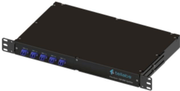
Figure 5: Tellabs FlexSym Singlemode to Multimode 2x8 Splitter (pictured) and Tellabs FlexSym Singlemode to Multimode 2x16 Splitter also available

Fiber Cabling – Even in the situation where there is existing multimode cabling already in the building riser, horizontal or pathways, there are choices that support Passive Optical LAN over either multimode or singlemode cabling. By using multimode optical splitters, currently available in either Tellabs® FlexSym™ Singlemode to Multimode 2x8 Splitter and Tellabs® FlexSym™ Singlemode to Multimode 2x16 Splitter split ratios, one can support OLAN over OM1, OM2, OM3 and OM4 fiber cable types [Figure 5]. The SMF to MMF optical splitters are passive, so these multimode splitters are highly reliable, require no monitoring and no maintenance. In fact, Optical LAN can uniquely deliver 10-gigabit over multimode fiber cabling further (up to 550m) when compared to traditional LANs options.