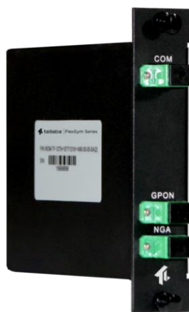
Figure 4: Tellabs FlexSym XGS-PON Combiner

WDM Combiner – The Tellabs® FlexSym™ XGS-PON Combiner can be utilized if G-PON and 10G PON are on the same fiber cable and optical splitter [Figure 4]. In the future there are no foreseen wavelengths conflicts, thus NG-PON2 can be deployed over today's infrastructure – this ensures that as bandwidth increases no disruptive rip-and-replace will be necessary. Optionally one can also segregate G-PON and 10G PON on separate physical infrastructures. This can be accomplished by simply designating different optical splitters, and associated fiber cabling, to be either G-PON or 10G PON.